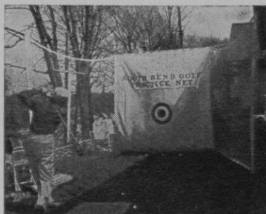
Leading Country Clubs Use South Bend Golf Practice Nets

Please enclose check, money order or purchase order.