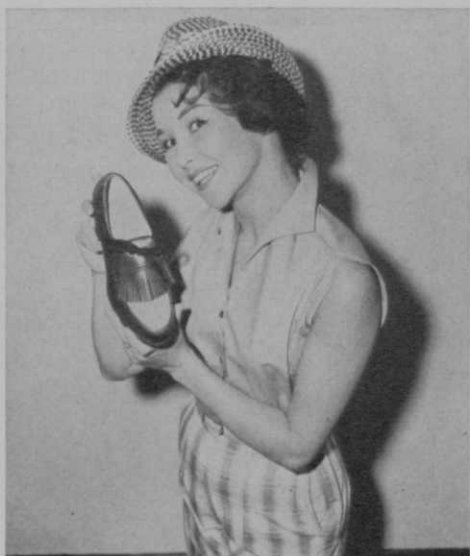
This garb can be worn for golf or away from the course. Etonic shoe is very latest for the gal golfer.

(Left) Swim suit (and contents) have GOLFDOM'S unqualified endorsement. Strong does thriving business with the sun set.