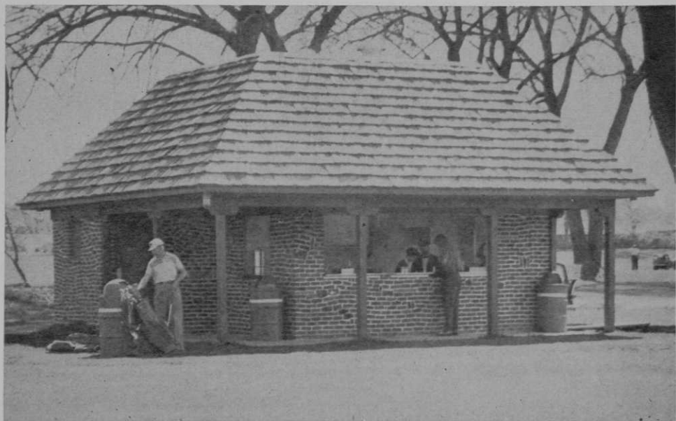
This halfway house has been put into operation at Cherry Hills CC in Denver, site of the 1960 Open. Built on the same design as the clubhouse, the service center serves a wide variety of foods. It has 220 volt electric grill, charcoal broiler, refrigerated sandwich unit and soda fountain. It's also equipped with an electrolarm burglar system that is wired direct to the clubhouse.

Sherwood Moore's difficulties, fortunately, weren't deferred until the eleventh hour. In his case, they presented themselves in January when Winged Foot's big maintenance building was destroyed by fire. With it went all the club's maintenance equipment (it cost around $50,000 to replace) and all the paraphernalia, such as ropes, posts, etc., that had been stored for use in the Open. By mid-March, Moore's equipment building, which cost $30,000 to replace, had been restored. So that gave the Winged Foot greenmaster sufficient time to get straightened out before he had to concentrate on the finishing touches that would get the course rigged up for the Open.