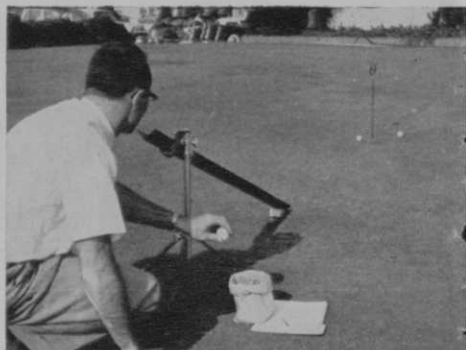
Fig. 1 — Mechanical putting test.