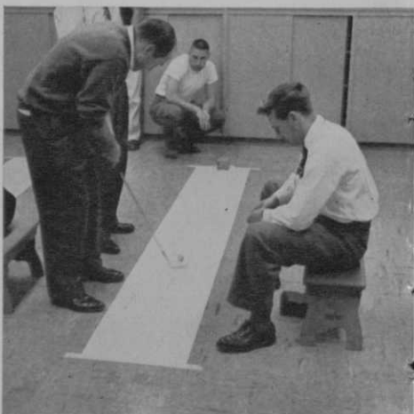
Fig. 2 — The flat level test.