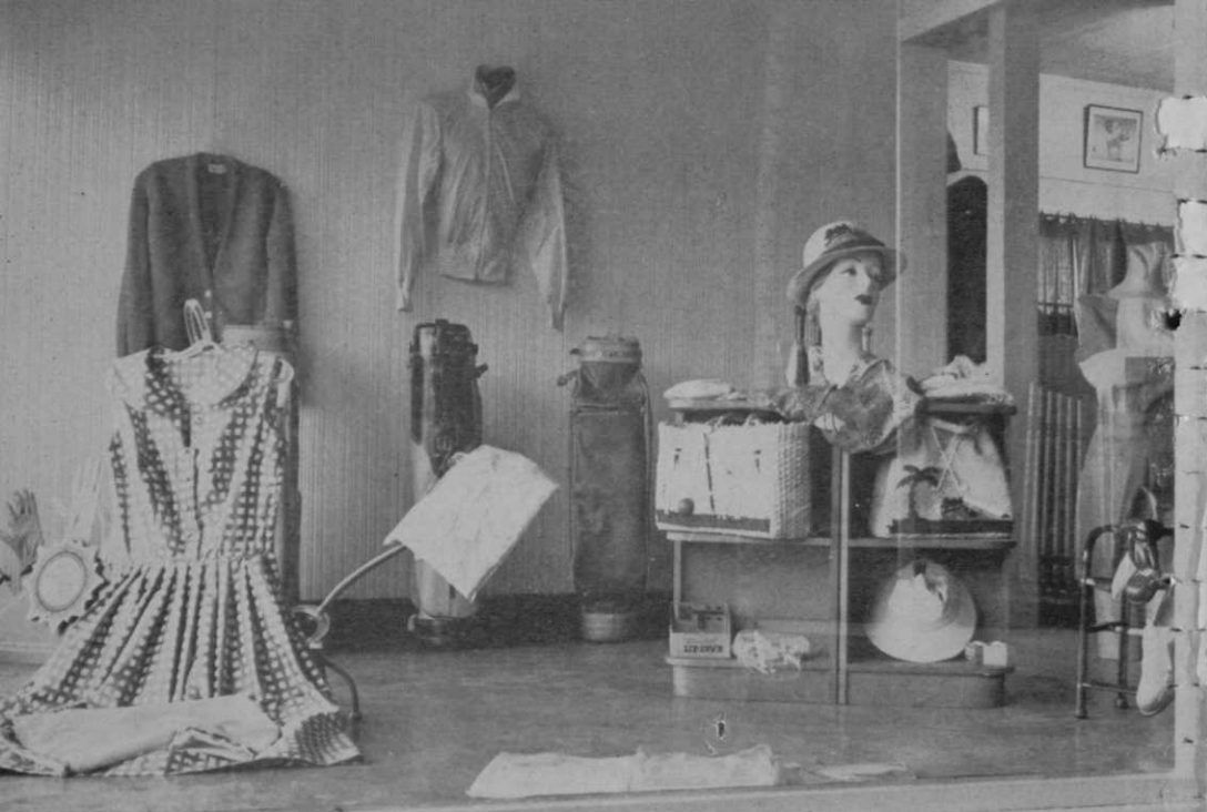
Wife of Ft. Myers pro is on constant lookout for new fashions that are displayed in this window.