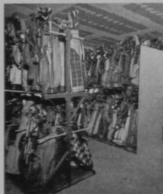
Installation at the Country Club of Charleston — by Carolina Cement & Supplies Co., Charleston, S. Car.

Clubs should take all possible precautions to prevent theft or vandalism.