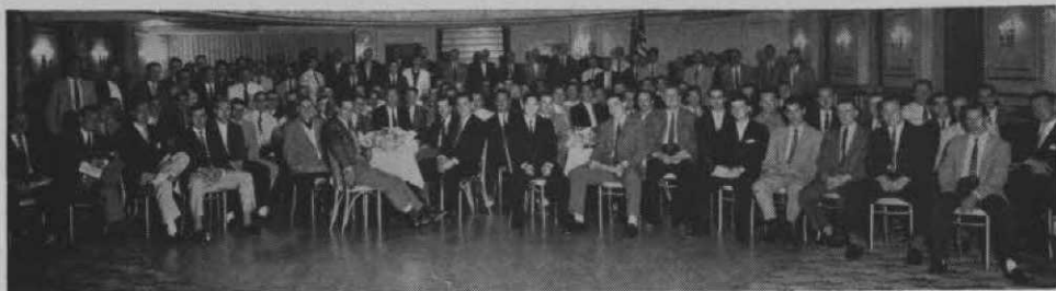
Banquet, sponsored by Fawick Flexi Grip Co., Akron, O., climaxed training program for assistant pros who attended Dunedin school in January.