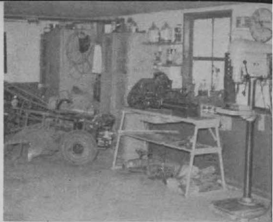
Two views of the well equipped maintenance shop at Pueblo G & CC.