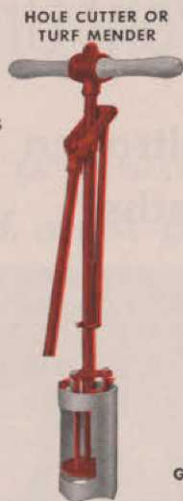
HOLE CUTTER OR TURF MENDER