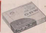
G. B. W. DETERGENT

For detailed information write to: PAR AIDE PRODUCTS CO. , Dept. G, 1457 Marshall Ave., St. Paul 4, Minn.