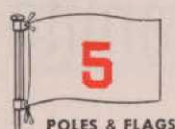
POLES & FLAGS