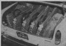
So Compact 4 or 5 Fit in Car Trunk