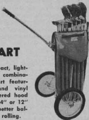
Model 100 With 14" Wire Wheels

A complete, compact, lightweight, low-cost combination bag and cart featuring aluminum and vinyl construction; zippered hood to protect clubs; 14" or 12" wire wheels for better balance and easier rolling.