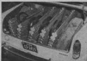
So Compact 4 or 5 Fit in Car Trunk