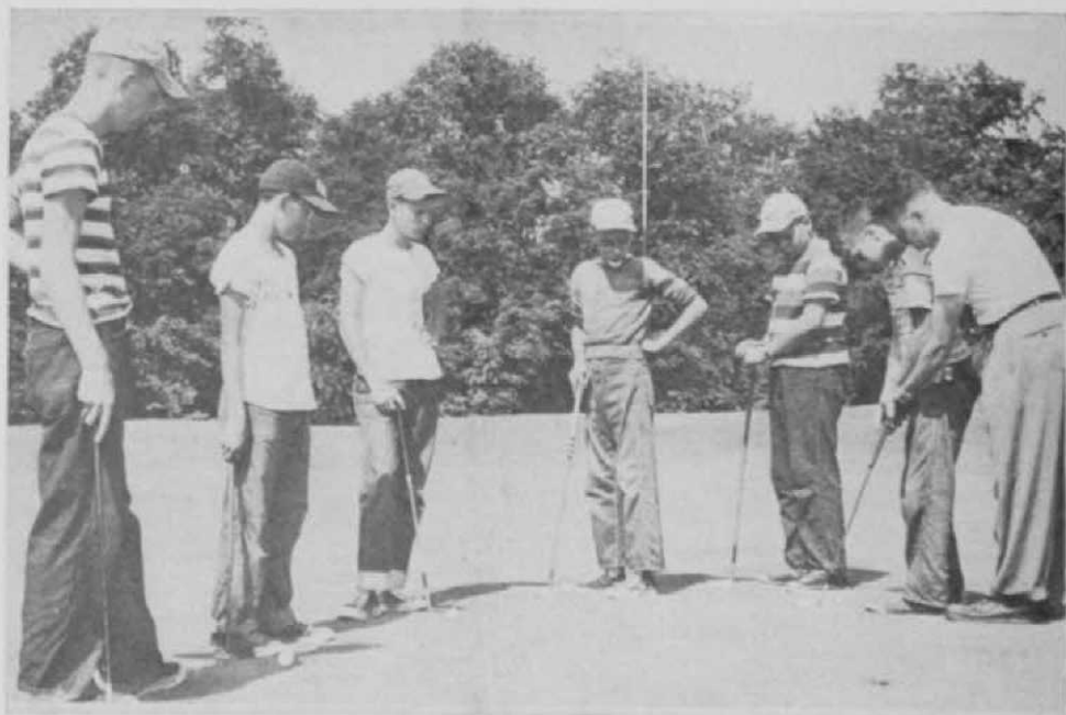
Wheeling kids learn to play the game as well as how to carry golf bags.