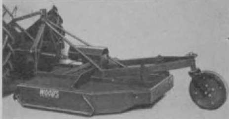
Wood's Model M60 hitch

Wood Bros. Manufacturing Co., Oregon, Ill., is now producing its latest models of rotary cutters, a line of 5-ft. machines that are