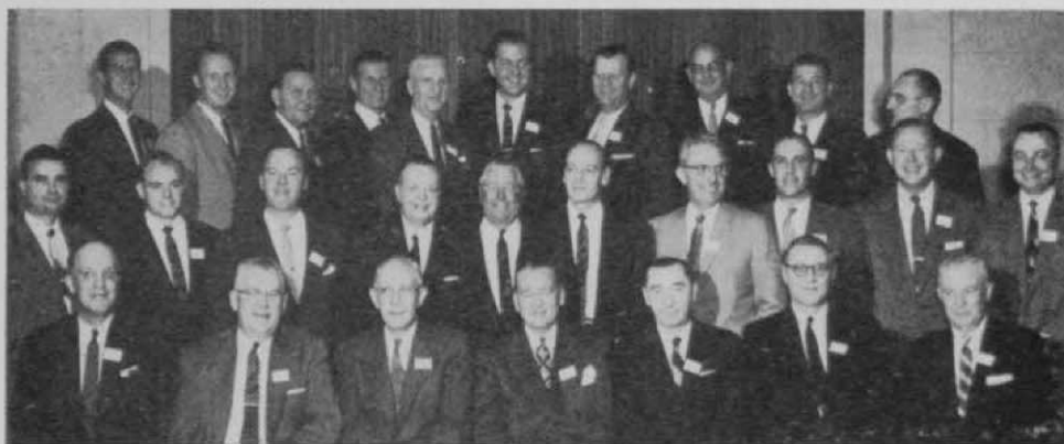
Dunlop sales reps and company officials pose for picture during break in annual meeting.