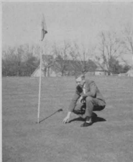
Robert A. Moore, who wrote this article, inspects fifth green at Whitmarsh Valley CC in Philadelphia, which showed great improvement after it was treated with Aqua-Gro.

Under localized dry spots there are several known causes such as thatch, pimples or contours and hard-spots. (Compacted areas will be discussed separately). These areas are hard to water — puddling in some areas, running-off in others — but in all cases, it is difficult for water to pene-