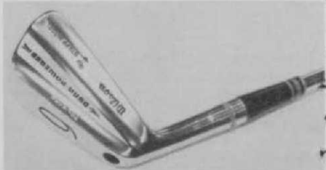
Wilson's Southpaw Staff model iron

Wilson Sporting Goods Co. is making available its Dyna-Powered irons, Staff model, for left handed golfers this year. They are fine