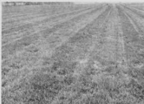
Common Bermudagrass stand on Squad "C" field, West Point 9 days after planting pre-germinated seed.