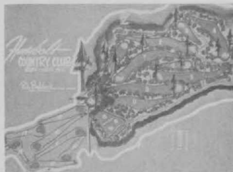
Humboldt Country Club