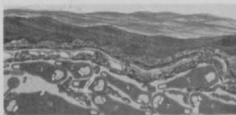
Lawton Springs Country Club