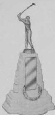
Trophy No. 12752-5 Sunray & Ivory Finish Height: 11 1/2" . . . $7.25