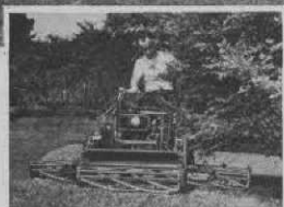
Cutting around overhanging shrubbery is easy with Riding Sulky attached.