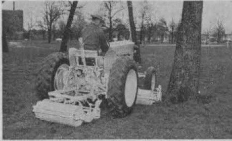
John Deere "420" Utility with Gang Mower.

A direction reverser that permits forward or reverse travel at the same speed without shifting is the highlight of several new optional