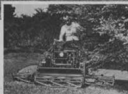
Cutting around overhanging shrubbery is easy with Riding Sulky attached.