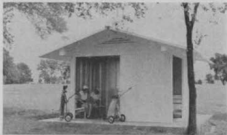
One of Armco steel shelters at Middletown's Wildwood course

Armco Drainage & Metal Products, Middletown, O., recently tested its new steel golf shelter at Westinghouse Electric Corp's high voltage lab with excellent results. Special lab equipment generated repeated surges of 3-