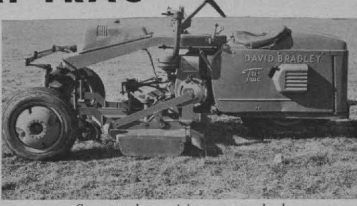
Guaranteed to satisfy or money back