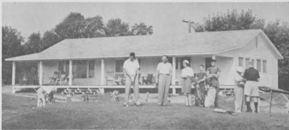
Comfortable if not pretentious best describes the combination clubhouse-pro shop at the popular Vermont resort. Pro and club president collaborated in designing it.