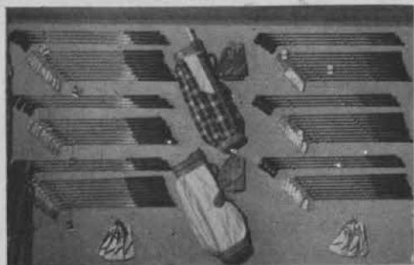
Displays such as this have helped Bill Hamilton's sales get off to booming start despite poor weather.

of what a fellow can do with a $1500 renovation budget and a "Do-It-Yourself" flair. In March, when Hamilton moved over to the Crete club from South Haven (Mich.) CC, where he had been pro from 1952 through 1955, he was confronted with four bare walls and a cement floor. Working 12 to 16 hours a day for the next month, Bill installed the pegboard walls which are painted peach, a celotex ceiling done in gray, and wall to wall carpeting over felt padding. Then he shopped around and