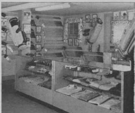
Counters with wearing apparel are spotted in center of the shop. In background is a second counter in which balls and tees are displayed. Hamilton's office is in alcove directly behind second counter.