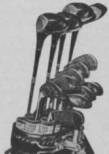
Oval or Round Type Bags