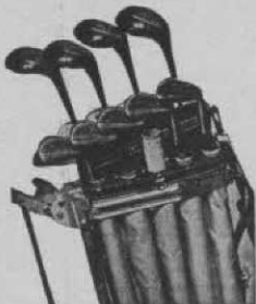
PAR TUBES As Used in Individual Compartment or Slot Type Bags

The demand is terrific and the profits are quick. PAR TUBES superior construction proves them tops in the field. A Must for any golfer who wants to protect his grips the full bag length and obtain a friction-proof bag with an individual compartment for each club. PAR TUBES are dropped into oval or round type bags allowing a numerical arrangement of clubs. PAR TUBES fit into and strengthen individual compartment bags, allowing full free use of EVERY compartment.