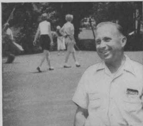
One of the beautiful greens at Essex County Country Club, West Orange, N. J.