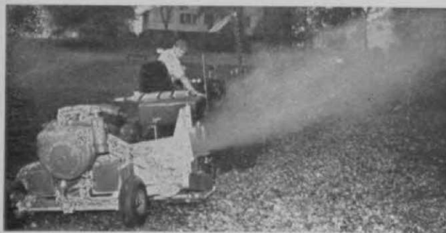
Nothing like it for spring cleanup of leaves & litter.

is just the thing for golf course leaf disposal. Vacuums up, cuts into fine mulch, returns leaves to ground in single operation or can be bagged. Tractor-drawn, 6' 5" pickup cleans up to 50 acres in 8 hr. day. 25 HP power unit shown, smaller models also.