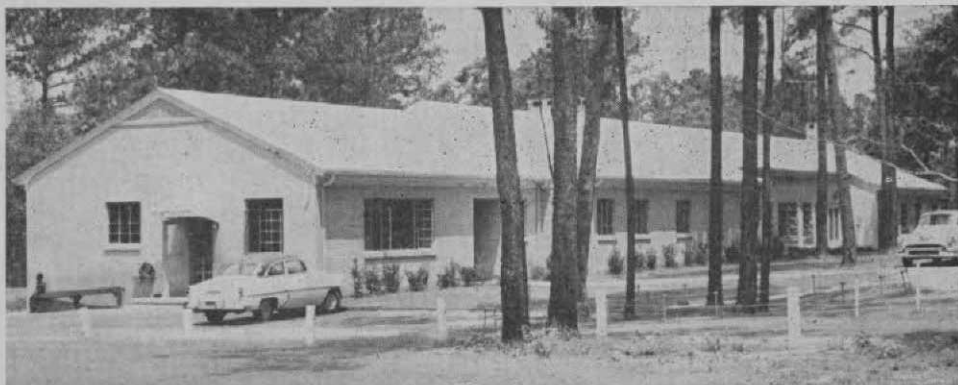
The two-year old clubhouse at Roanoke CC is described as one of the finest of its size in the country. Joe Maples' pro shop is in the wing on left.