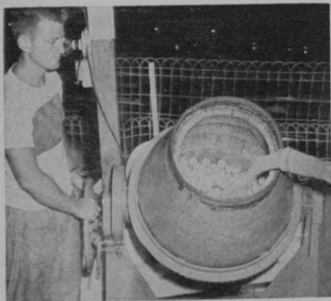
Sump pump feeds cleaning solution into brush lined mixer after quick loading thru open end.

For further information you may write to Wheaton at the Lincolnwood Golf Driving Range, Lincoln and Touhy Avenues, Lincolnwood, Ill.