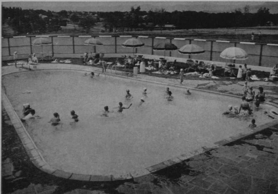
Lakewood CC, Denver Colo., pool is painted with the chlorinated natural-rubber-base type paint Ramuc because it has high resistance to penetration of pool water.

A well-known pool paint of this type is Ramuc. It is used on country club pools all over the country, including those at Tam-O-Shanter CC, Niles, Ill.; Detroit (Mich.) GC; Montclair (N. J.) GC; Morgantown (W. Va.) G&CC; Shorehaven GC, South Norwalk, Conn.; Cedar Hill CC, Livingston, N. J.; and Lakewood CC, Denver, Colo. Ramuc is produced in chlorinated natural rubber-base grades for both concrete and steel pools and in special