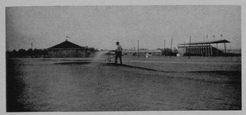
This view of the 6th green at the Woodward, Okla., municipal course, shortly after seeding, gives you an idea of the nearly impossible job of watering in a 40-mile wind, during the later stages of course building.

"The period between March 25 and April 15 was spent in mixing and placing the prepared topsoil on greens and although some mild weather was encountered during this period high winds again handicapped this operation and farther