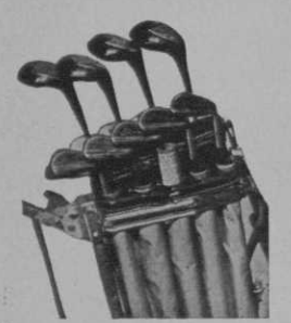
PAR TUBES As Used In Individual Compartment or Slot Type Bags

The demand is terrific and the profits are quick. PAR TUBES superior construction proves them tops in the field. A Mass for any golfer who wants to protect his grips the full bag length and obtain a friction-proof bag with an individual compartment for each club. PAR TUBES are dropped into oval or round type bags allowing a numerical arrangement of clubs. PAR TUBES fit into and strengthen individual compartment.