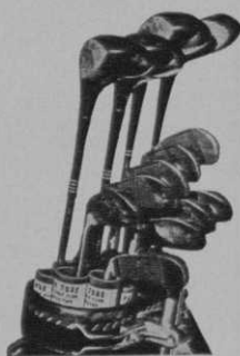
Oval or Round Type Bags

Pro, managed the affair and has since established and displays all articles pertaining to golf in the Ladies' Locker Room. This has met with much approval and is most convenient.