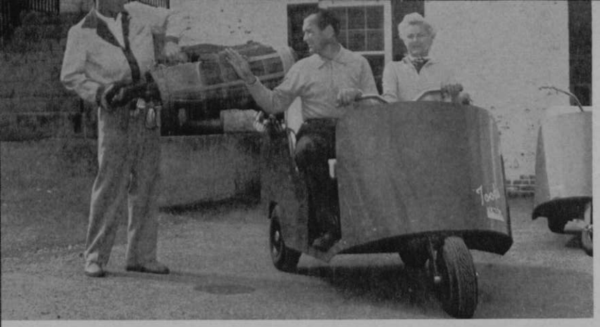
Two passengers are golf car capacity. No hitch-hikers, please.