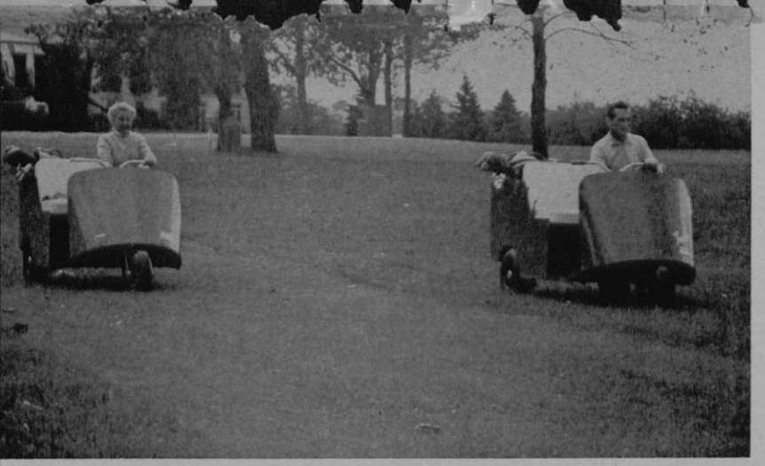
You take the high road. Ill take the low road. Take different routes.