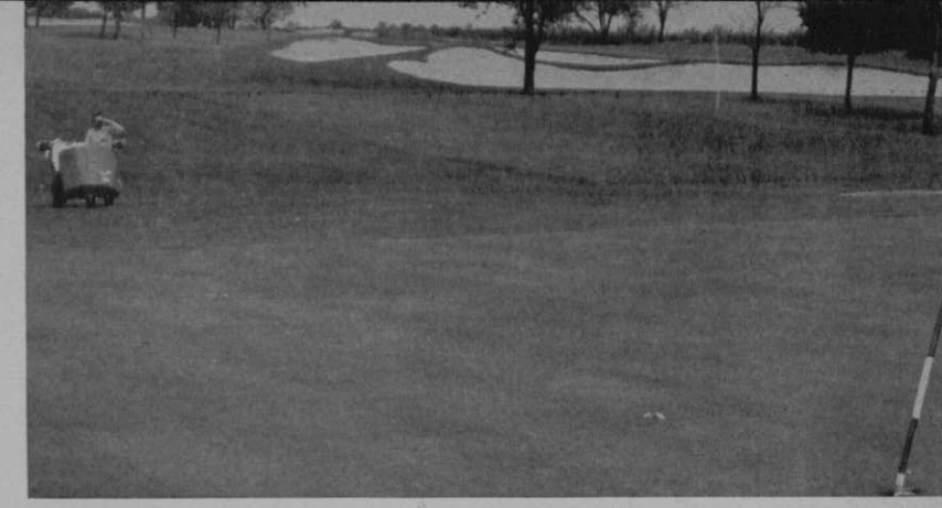
Stay at least 30 feet from each greens approach to drive wisely.