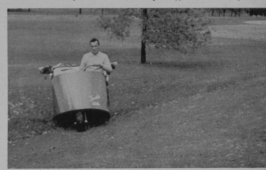
Go up hill zig-zag, reducing the grade and avoiding danger to turf.