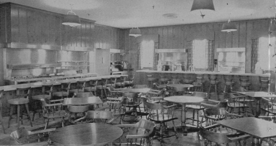
Attractive snack bar and grill of NCR clubhouse is equipped and laid-out for quick, pleasing service.