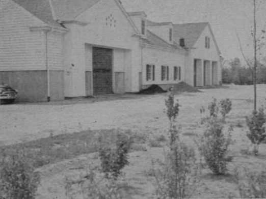
Landscaping was planted early on the road side of the equipment building to dress it up as fitting a fine residential district.

in determining the installation which was trenched by Southern Hills Pit, Inc., Dayton. Galvanized steel pipe (10,000 ft.) was used in lead-offs to sprinkler heads. Plastic pipe was used for drinking water lines.