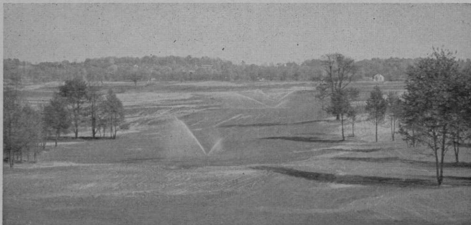
Sprinklers were put into action early and speeded development of good turf on soil that had been well prepared and seeded.