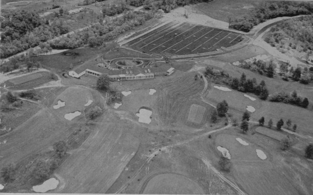
From the air you see, in the foreground, left to right, in a semi-circle around the clubhouse the 1st tee, 9th green, 18th green and 10th tee of the South course; and the 9th green, 10th tee, 18th green and 1st tee of the North course.