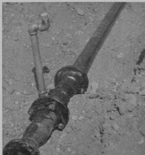
Stony character of soil before topsoil covering is shown during the installation of Clow-National mechanical joint cast iron pipe and riser for one of the Skinner fairway sprinklers.

Already there are 2300 golfing memberships — 2000 employees and 300 of their wives. The yearly golfing fee is $5 per person. For those who don't have yearly memberships the price per round is 75 cents Tuesday through Fridays. Weekends and holidays the greens fee is $1. The an-