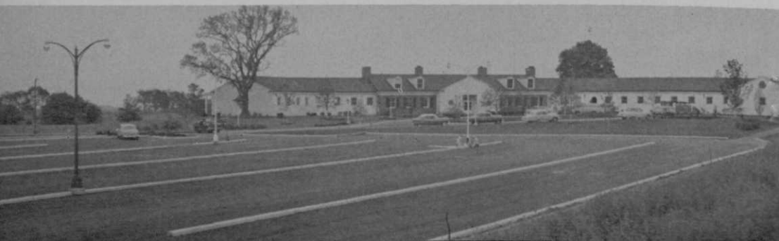
Front of the NCR clubhouse partially shows parking space for 600 cars. Practice and instruction tees are to the left of this area.

Clow-National mechanical joint castiron pipe in 3 in. thru 10 in. sizes and to the extent of 40,910 ft. was used. Durability, low maintenance cost and flexibility were performance and economy factors figured