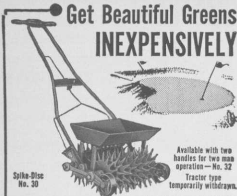
Spike-Disc No. 30

Available with two handles for two man operation—No. 32 Tractor type temporarily withdrawn.