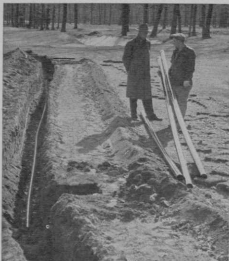
Roy S. Jones, pro, (L) and Anthony Matuza, supt., (R) inspect Triangle plastic pipe ready for installation.

cated in the shop (a rainy day job). This fabrication consisted of a metal riser, a metal coupling, a threaded male adapter, a nipple, reducer and a plastic tee into which the lengths of plastic pipe were cemented.