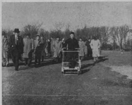
Demonstration of West Point Products new thatch removing machine for group during Pine Valley Tour.