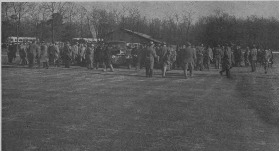
Part of 375 who made tour of Pine Valley CC during annual GCSA meeting inspecting test plots of Meyer Zoysia over seeded with cool-season grasses.