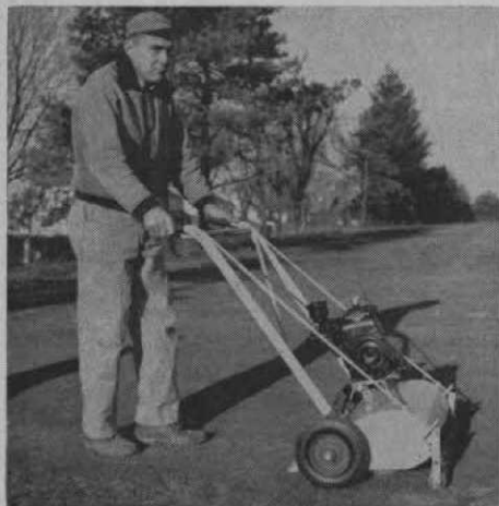
West Point's new machine for removing thatch.

For the 4th consecutive year the Philadelphia Golf Course Supts. Assn. held its regular December meeting in cooperation with West Point Products Corp. Superintendents assembled at the West Point Products plant in the morning. A new machine for removing thatch from turf