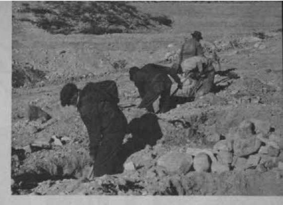
More than 2500 dumptruck loads of rock were removed from 33 acres in clearing for the NMIMT course. Rock was moved to be used effectively in course construction.

and constructing the Socorro course as his first major job assignment after receiving a B.S. degree in landscape architecture from Michigan State College in 1950.