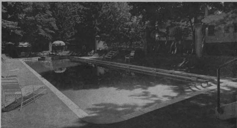
The pool at Rolling Rock Club, Ligonier, Pa., is a charming exhibit of the smaller pool installations at country clubs, and another illustration of wise painting practice.