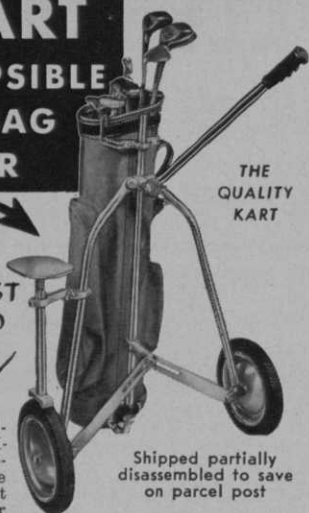
THE QUALITY KART

Shipped partially disassembled to save on parcel post