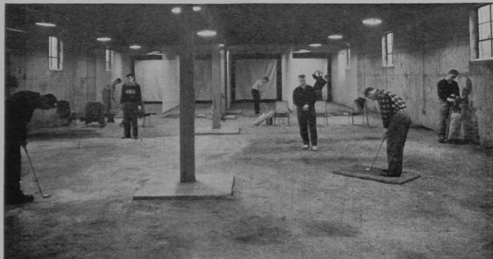
This large basement room of the new clubhouse is 75 by 130 ft. At the far end are four practice driving nets and floor to the left is made of special composition material used for practice putting surface. It's big enough for plenty of free swinging when the chill winter winds blow.