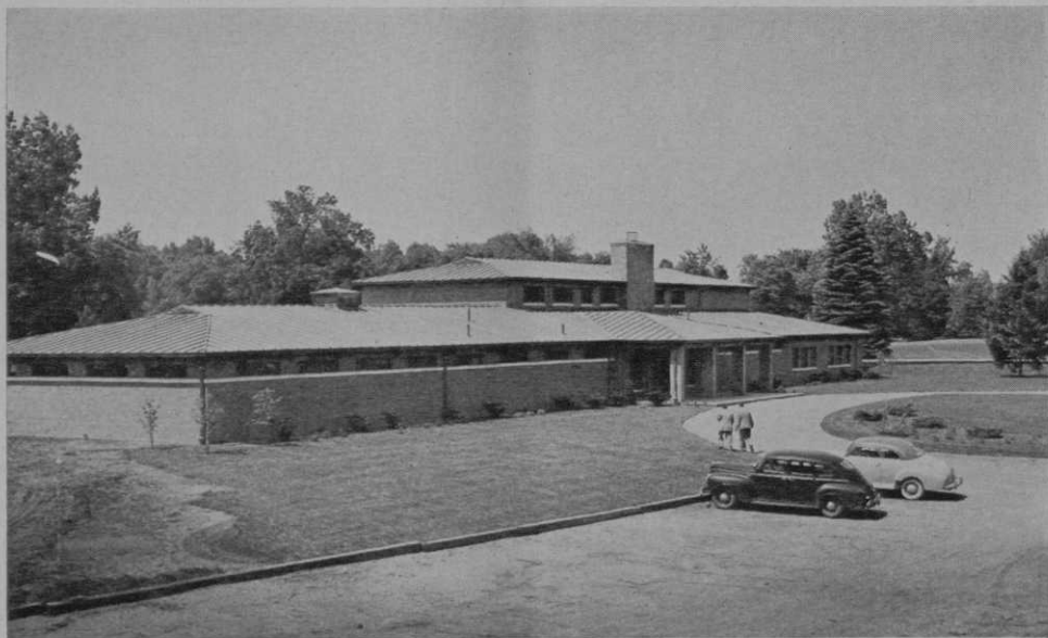
New clubhouse at the University of Michigan golf course built with funds from the athletic department has huge basement for year 'round indoor practice facilities.