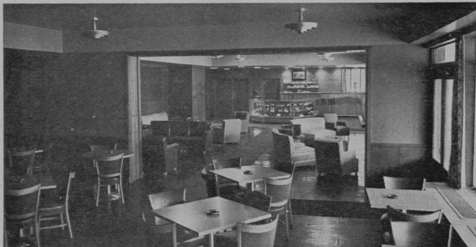
Looking from snack bar through combination lounge and pro shop where open club displays and merchandise display counter are conveniently located for anyone entering or leaving the clubhouse.

of space to do an adequate job of merchandising.