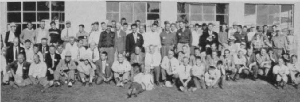
Above may be seen most of the more than 100 greenkeepers from Indiana and Michigan who attended the third annual golf and barbecue party given in early August by Ferguson and Sons, golf equipment manufacturers and dealers, at their Eau Claire, Mich., plant.