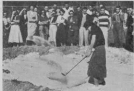
Miss Suggs demonstrates blast shot from sand trap built by students who use it to get much needed practice for those shots that stray from the fairway when they get on the golf course.