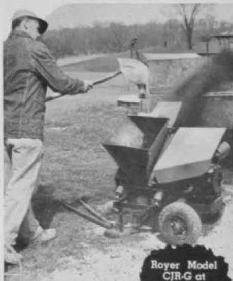
Royer Model CJR-G at Bridge View, Columbus, Ohio.