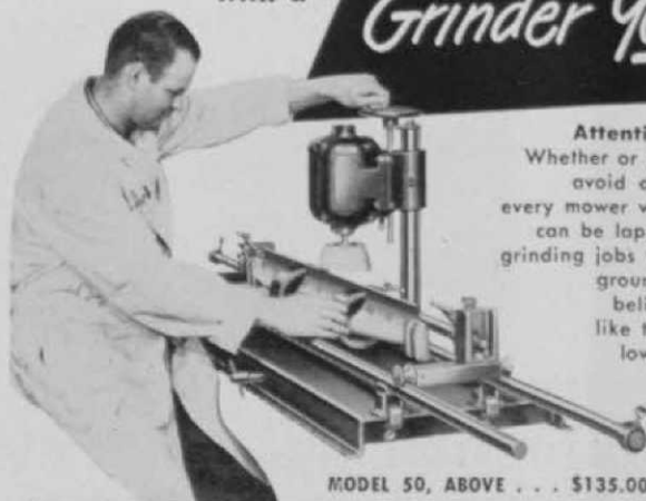
MODEL 50, ABOVE . . . $135.00 F.O.B. Plymouth, Ohio

Attention Golf Clubs, Parks, Cemeteries! Whether or not you do your own grinding, you can avoid delays and increase the service life of every mower with the Model 50 Bench Grinder. Reels can be lapped in several times between complete grinding jobs when the bed knives are kept properly ground on the Model 50. The price? Hard to believe . . . but true! Never has a machine like the Model 50 come anywhere near this low cost. Perfect companion to the famous PEERLESS MOWER SHARPENER. Write today for descriptive bulletin.