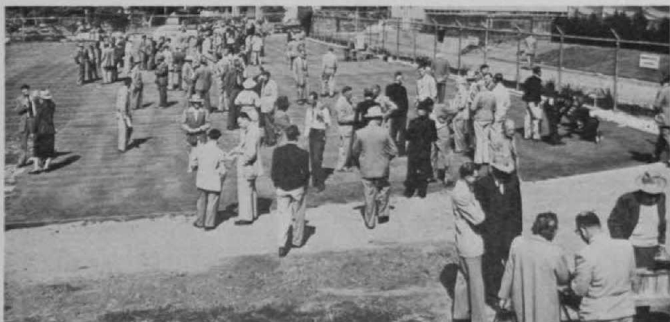
General view of putting green turf plots at UCLA during Southern California Turf Conference.