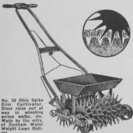
No. 30 Ohio Spike Disc Cultivator. Discs raise out of way in wheeling across walks, etc. Made by the mfrs. of Dunham Water Weight Lawn Rollers.

Use it to open up the soil to admit seed, lime, fertilizer, top dressing. Operates quickly and easily, making neat little pockets in the turf that prevent loss or waste of seed and promote quick germination. Aerates and cultivates the soil, forming a mulch that retains moisture. Invaluable during the hot months, when soil is sun-hardened.