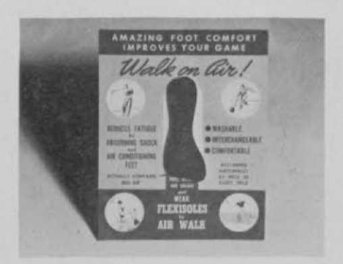
Counter display card for Flexisoles.

Air Walk Cushion Insoles is the trade name of a new featherweight rubber foam construction insole designed to fit any size shoe. Thousands of minute air-holes combined with top-to-bottom perforations forces air around the foot and toes to give