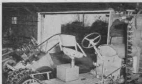
Interior of Oakland barns, showing double doors to permit passage of tractors and units.

in Oakland's course equipment barns, which have wide double doors which enable tractors with their full units to enter and exit without having to take time out to remove the units. All of Oakland's tractors, trucks and other equipment are under cover, indoors, at all times when not in the field. Lyons introduced special barns for fertilizers and concrete vaults for his seed. He and course supt. Cedric Tumber claim to have the perfect golfing layout at Oakland.