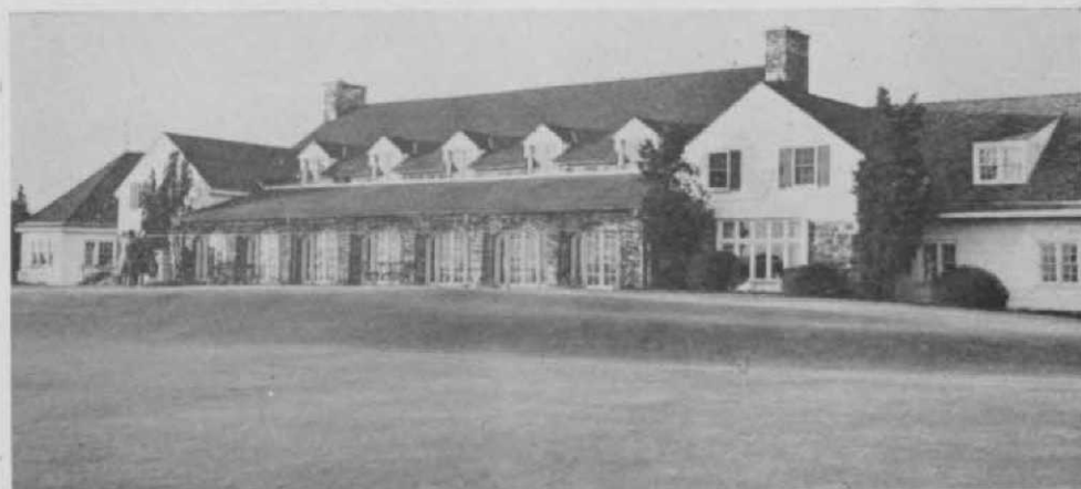
Oakland GC clubhouse, showing extensive putting green, one of the largest in the east. Near men is bronze statue of Walter J. Travis on pedestal.

The course was in only fair shape. The club had had a half dozen managers within a few years. The bookkeeping was done at the treasurer's office in Pine street, Manhattan, and most of the orders were given by remote control from Wall street. The clubhouse was in mediocre condition, especially the kitchen which was operating with obsolete equipment.