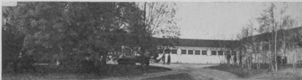
Extensive barns of Oakland are heated in winter and are most modern. Superintendent's house is back of tree to left. Fire hose is ready in box under tree.