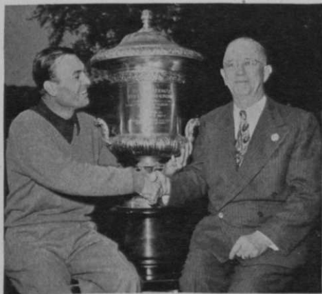
Ben Hogan accepting International Cup from George S. May after winning International event.

tion the results of each play of the two contestants he was assigned to follow, and the main station in turn would short-wave the results to the radio men in all the galleries. The standard bearer in the gallery would then mark up his board, which carried the names of all eight contestants,