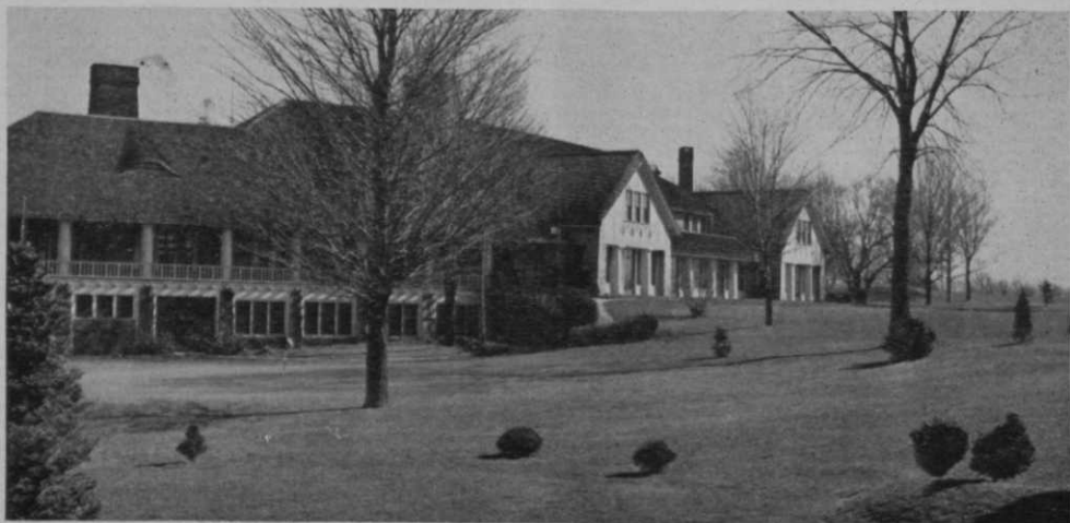
Rear view of Kakhwa CC. Part of green of pitch-and-putt course planted with 95 kinds of evergreens shown at bottom right.

Kakhwa drifted along until 1936 and 1937 when it staged 2 membership drives and brought the total again to 360 with golf dues at $135 and house dues at $90. Then the downhill drift began again until it culminated in the approximate shutdown of the club in 1943 with the war pall given as the reason. Skilled management in the house might have saved the situation even then but the club was turned over to the bookkeeper.