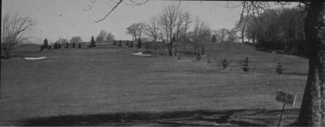
Back of No. 7 green, formerly very open, now is graced with Concord firs and Colorado blues.