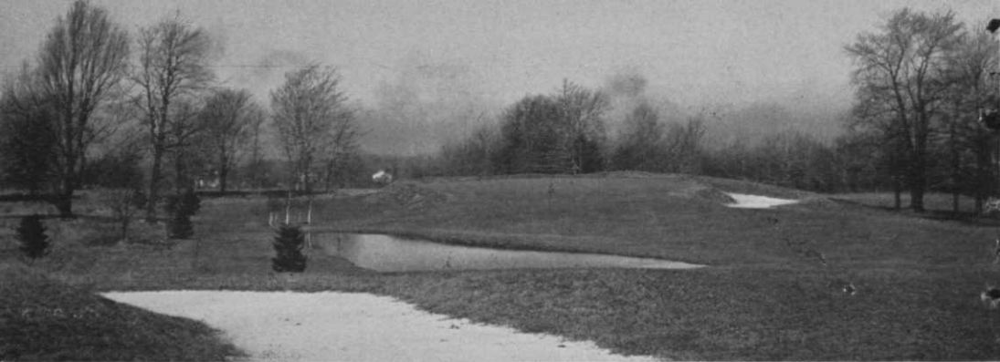
Approaching No. 3 green at Kahkwa. New evergreen plantings shown at left.